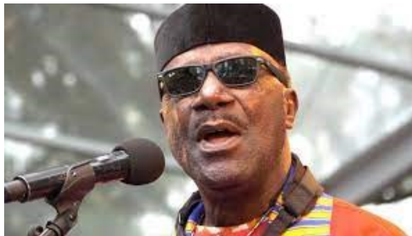
Gyedu Blay Ambolley